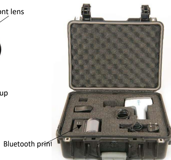
Figure 2: 3nethra aberro in a portable case